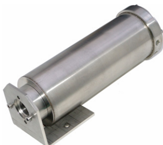
Protective and cooling housing WK15