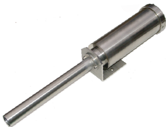
Protective and cooling housing with air purge and extension tube